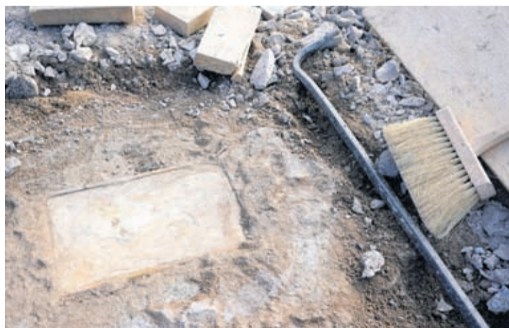
A time capsule that was placed in 1887 in the pedestal that once held the statue of Confederate General Robert E. Lee is uncovered on Monument Avenue, Friday Dec. 17, 2021, in Richmond, Va.